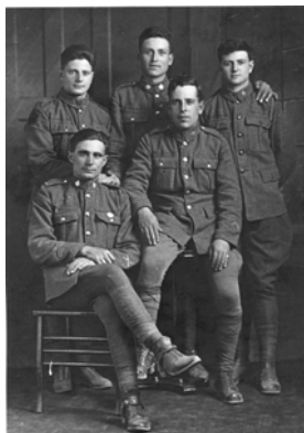
World War I soldiers in uniform before heading off to war.

February 16th to 22nd is Heritage Week, and this year's theme is Defending Canada. The Trail Historical Society is coordinating with the 44th Field Squadron, the Trail Legion, and the Sea and Air Cadets to produce an exhibi-