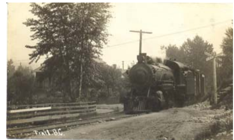
Train rounding the top of the Gulch, year unknown.

The Trail Historical Society meets On the 2nd Tuesday of every month On 2nd floor of City Hall At 1:30pm