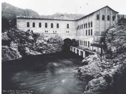
Rear of Lower Bonnington power house - W. K.P. & L. Co.

As a result of the success of that project, Aquila Networks Canada has approached the Society to submit a proposal to organize,