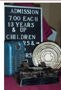
Speaker, car heater, film splicer and the last admission prices - just some of the artifacts from the Auto Vue Collection.

We will be using the items to create a display in the Museum over the summer. Come in then to view the collection.