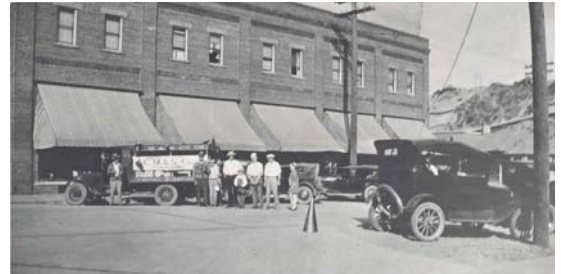
Company Store and delivery trucks, 1928.

So, keep an eye out for the next issue—it will be interesting reading.